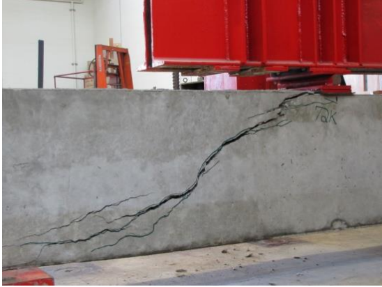
(a) Conventional Concrete